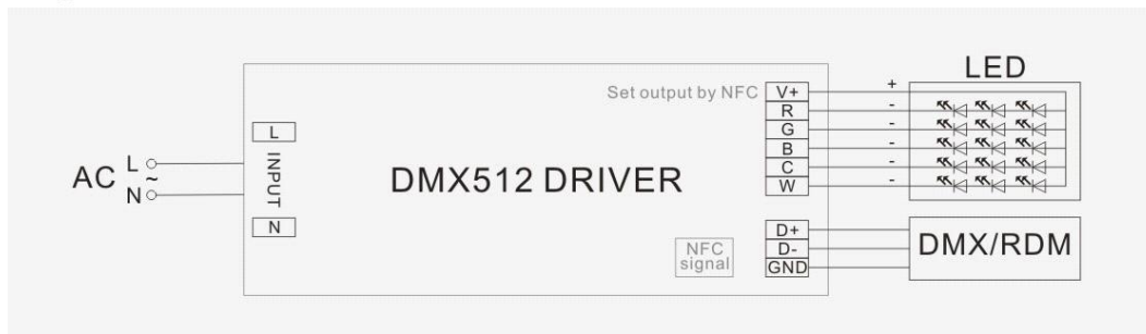
Diagram - 5 CH