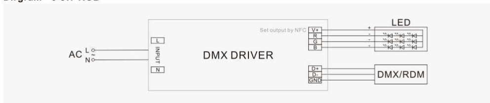
Diagram - 3 CH RGB